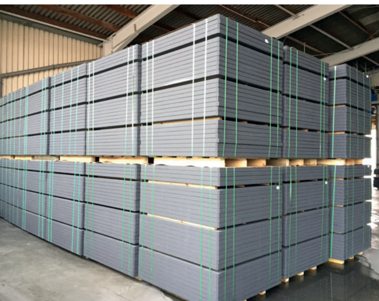
Around 19,000 production boards leave Wasa's plant in Thuringia every month.

The forms in which the solid plastic boards are manufactured using the extrusion method are equipped with a sophisticated cooling system. This energy-efficient and innovative system with absorption cooling is rounded off by a heat recovery system.