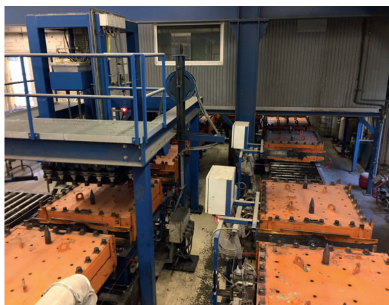
Wasa Uniplast® Ultra boards are produced in these moulds 24 hours a day, seven days a week.