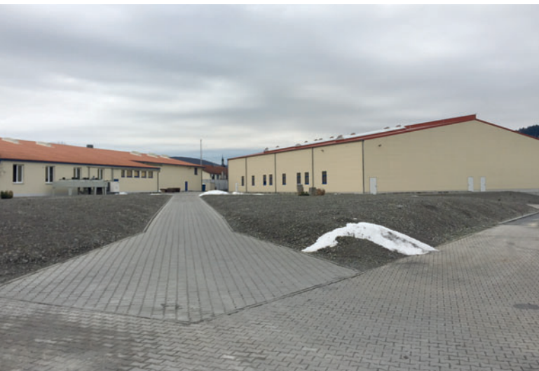
The new twin-aisle production hall (right) had become necessary due to strong growth and was inaugurated very recently.

As part of the reconstruction of the plant as such, the ensilage of the raw material and the transport of the plastics from the silos to the machine workshops will be completely revised. "The measures in this area will meet the highest demands for the reproducibility of the material batches and product mixtures and will enable an even more precise dosage of the raw materials employed", says Dr Arno Schimpf. This rebuilding work will be supplemented by the installation of new mixing technology.